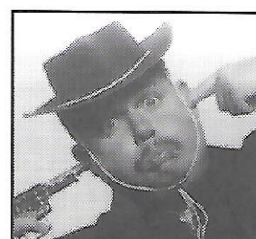
Cledus T. Judd