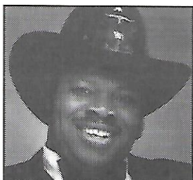
Big Al Downing