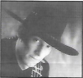
Hank Williams III