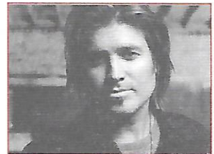
BILLY RAY CYRUS